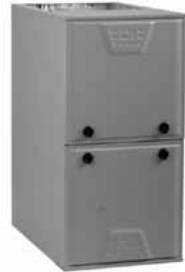
Illustrations and photographs are only representative. Some product models may vary.

* For owner occupied, residential applications only. See warranty certificate for complete details and restrictions, including warranty coverage for other applications.