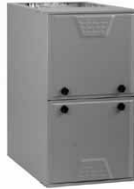
Illustrations and photographs are only representative. Some Product models may vary.

* For owner occupied, residential applications only. See warranty certificate for complete details and restrictions, including warranty coverage for other applications.